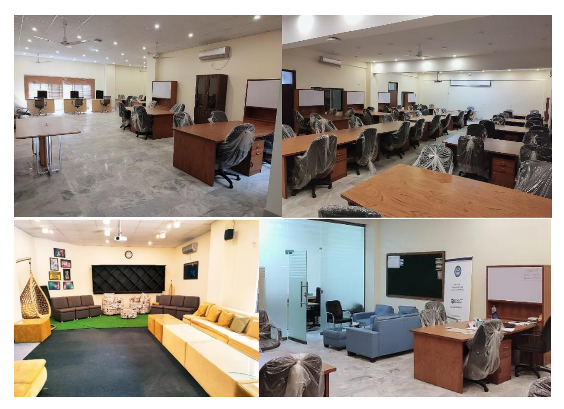
NUML Career Development & Placement Services (NCDPS)

Business Incubation Centre of NUML (B ICON) provides wide range of services to incubatees to propel them to new heights and sustain in industry. Incubation Centre provides advisory services, consultancy, trainings, workshop advisory services, marketing and promotional services, technology transfer development and business linkages. The Centre connects incubatees with network of industrial experts, entrepreneurs, angel investors, advisors and mentors for innovation, idea generation and business creation.